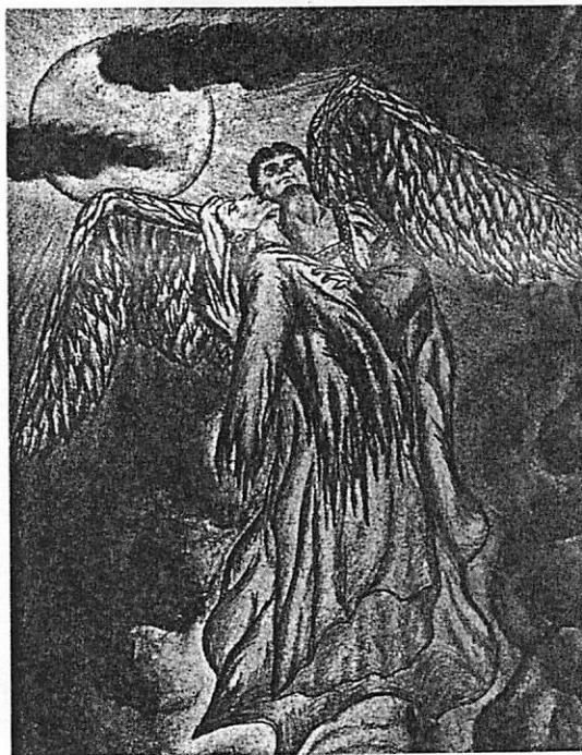
Messenger, 1994. In a dream, the angel carries me, a torn and broken man, toward a place of rest and healing. (Psychic Warrior, St. Martin's Press, 1996)